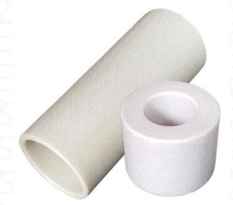
Electrical insulators and thermal insulation