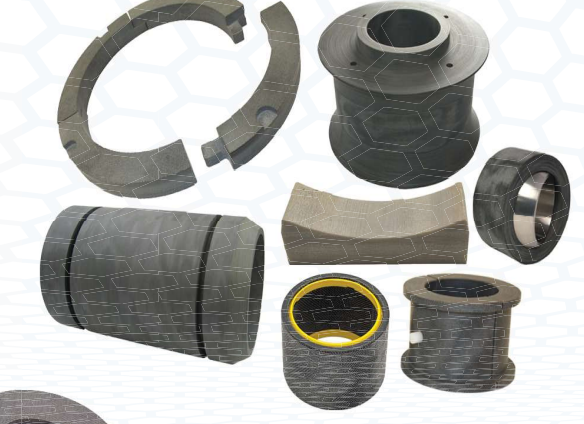
Custom machined components

Wear pads: curved, segmented, countersunk or counterbore holes